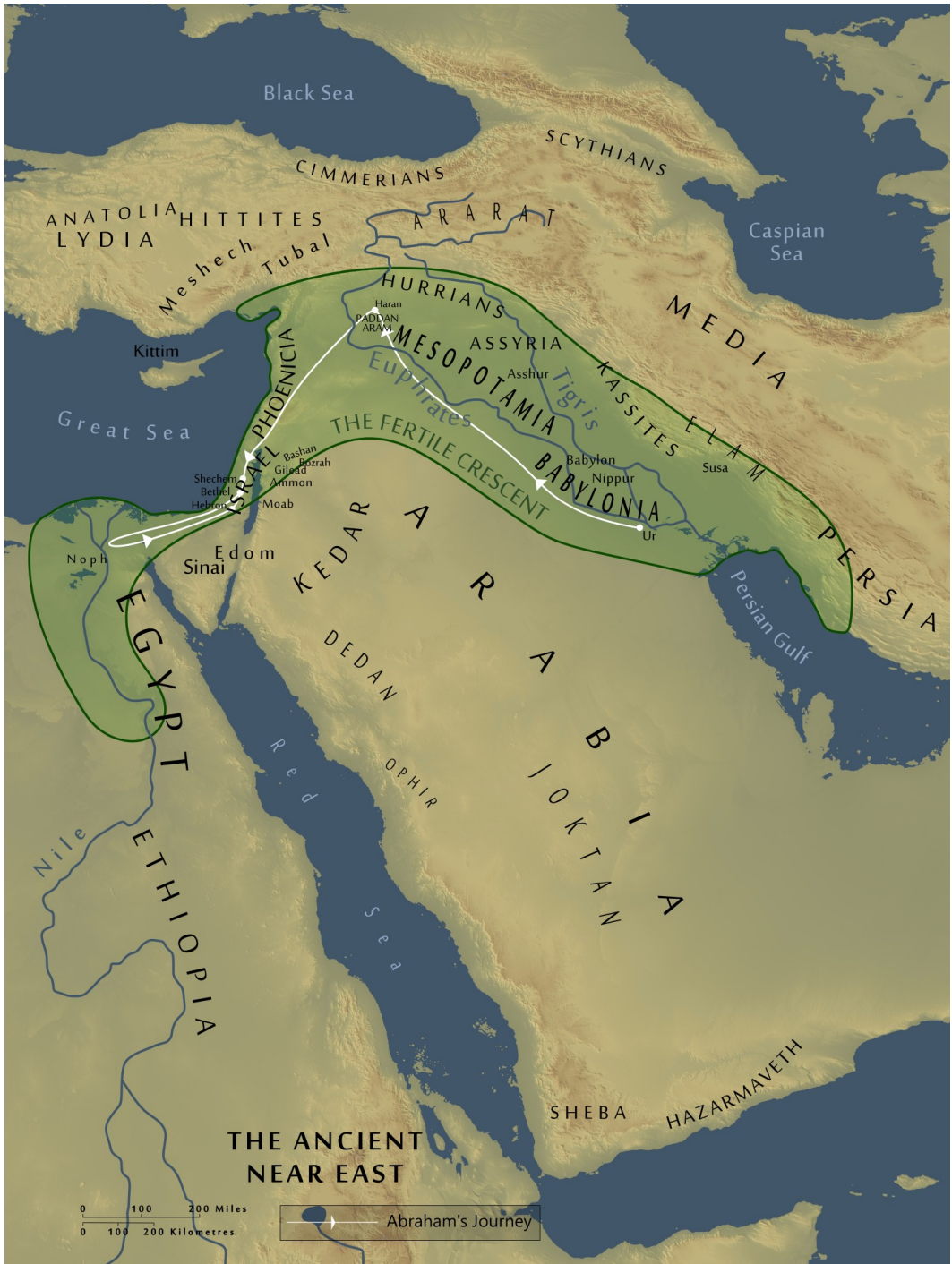
The Ancient Near East