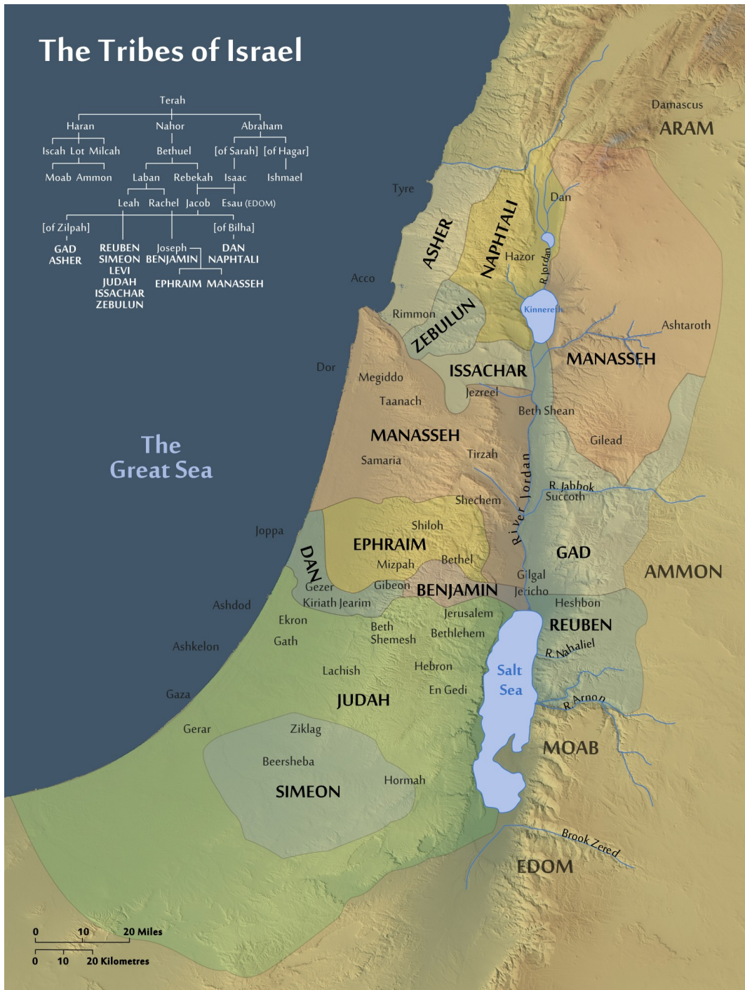
The Tribes Of Israel